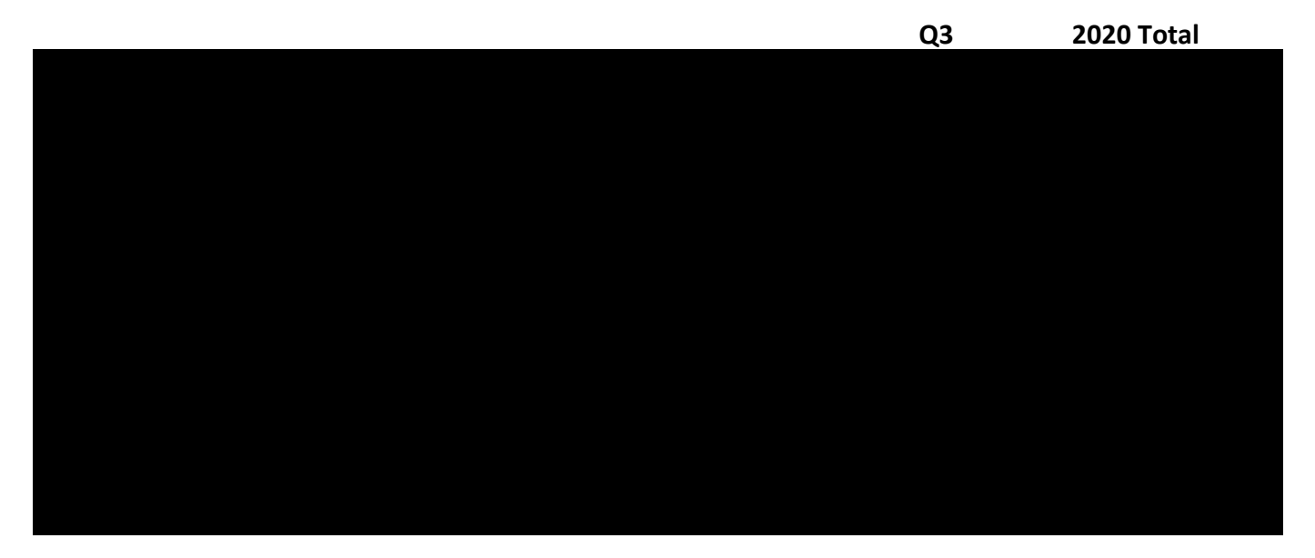
Figure 2. 2020 Q3 & Total Benefits

DATE FILED: November 16, 2020 Page 7 of 7